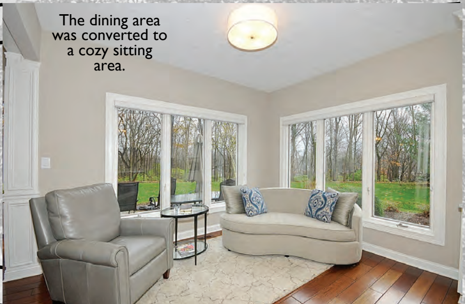
The dining area was converted to a cozy sitting area.