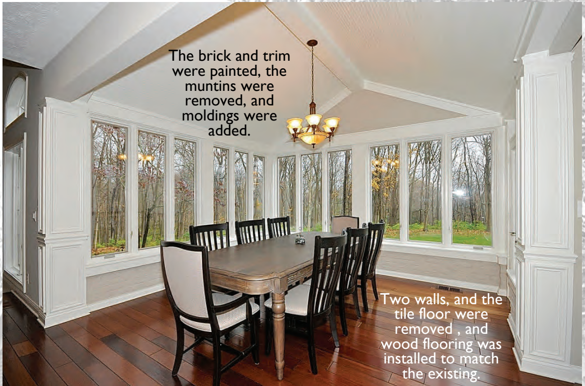
The brick and trim were painted, the muntins were removed, and moldings were added.