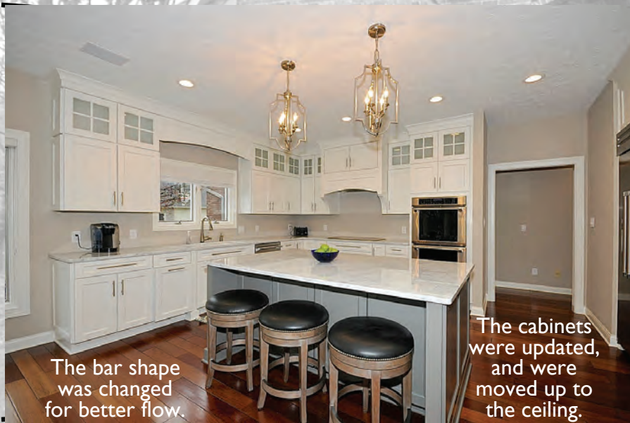
The bar shape was changed for better flow.