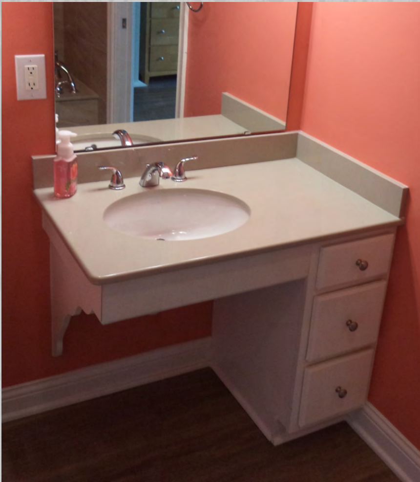
Above: An example of a vanity that a person can access from a wheelchair.