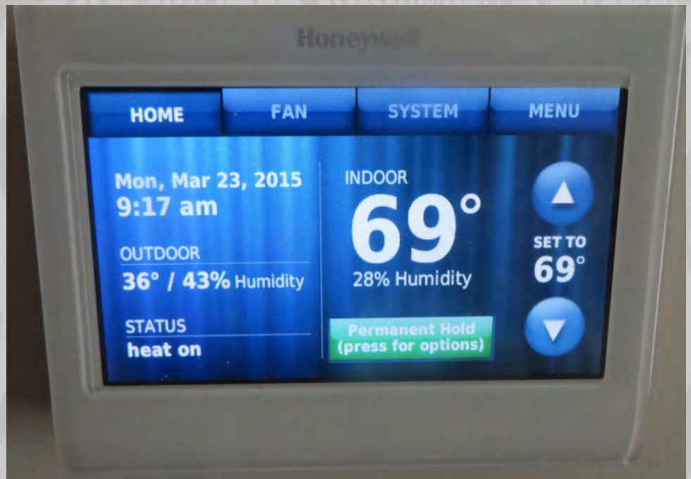
Above: An example of a smart thermostat that can be controlled from a smart phone.

Save money by improving the energy efficiency of your home. If the walls are getting opened up already, it's the perfect time to install better insulation, weather seal, get higher efficiency appliances, tape the ducts, and possibly upgrade the HVAC system and/or thermostats. There are even smart thermostats that can be fully automated and accessible by smart phone/device. You can also choose low-flow plumbing fixtures to conserve water each month.